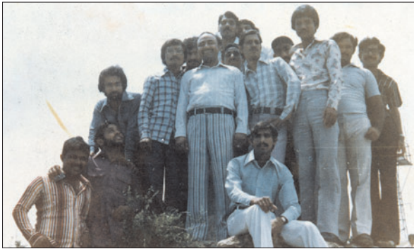
Up at the top of Tarbela Dam 1980