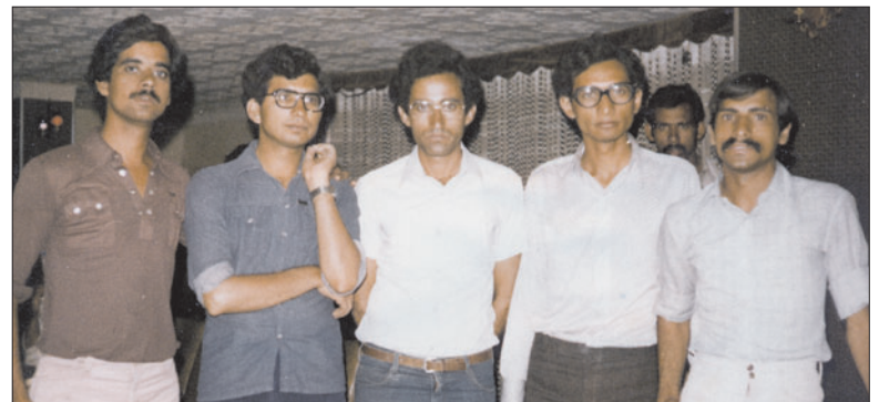
Exhausted at Murree 1980