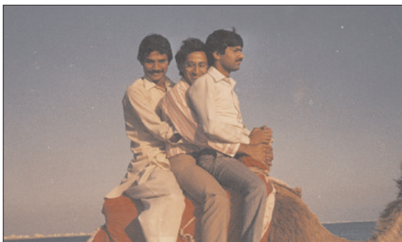
Camel Riding at Karachi 1981