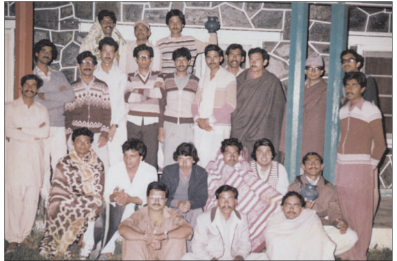
"Lota" exhibition at Kaghan 1981